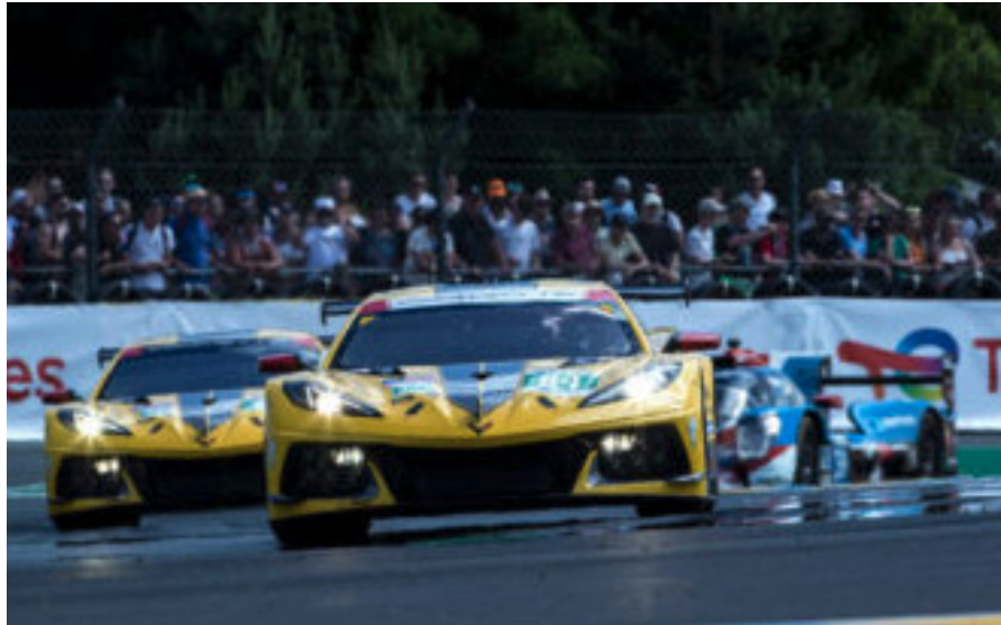
Corvettes leading the Pack at Le Mans

What originally looked to be a great outing for Corvette Racing ended in bitter disappointment. During the time trials the Corvettes placed 1 and 2 landing them in the front row for the race. This hasn't happened at Le Mans for over 20 years! And, for much of the race they were leading their class!