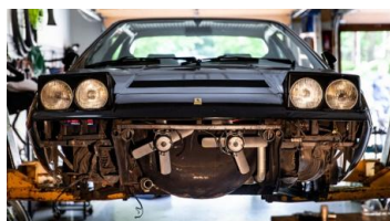
1975 308 GT4 before disassembly My 1975 308 GT4 before disassembly.

"The human at the center," Vigna continued, "is fundamental" to the experience of owning and driving a Ferrari. I absolutely treasure that quote, partly because now I don't feel so bad about the thousands of dollars I'm dumping into my middle-class Ferrari restoration. I bought what is likely the least expensive Ferrari available, a 1975 308 GT4, for $25,000, which is Mustang money. For my home-garage restoration, I'm hiring experts for the big stuff like paint but am personally tackling whatever I can. Here's my latest progress report. The body and engine are currently at separate shops so I'm currently in a holding pattern.