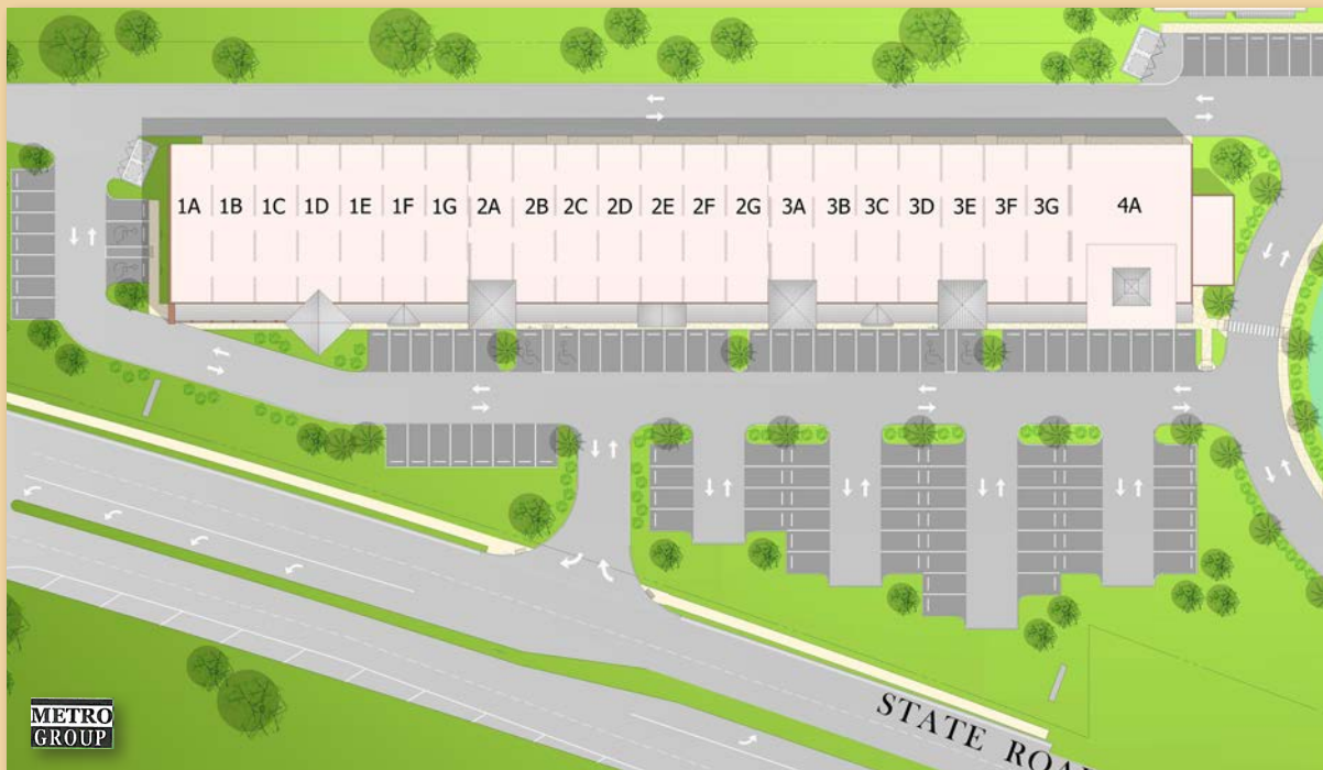
Enlarged Building Plan Spaces 1A – 1F, 2B – 2F, 3B – 3F each 1,500 square feet Spaces 1G, 2A, 3A, 3G each 1,525 square feet Space 4A 4,300 square feet