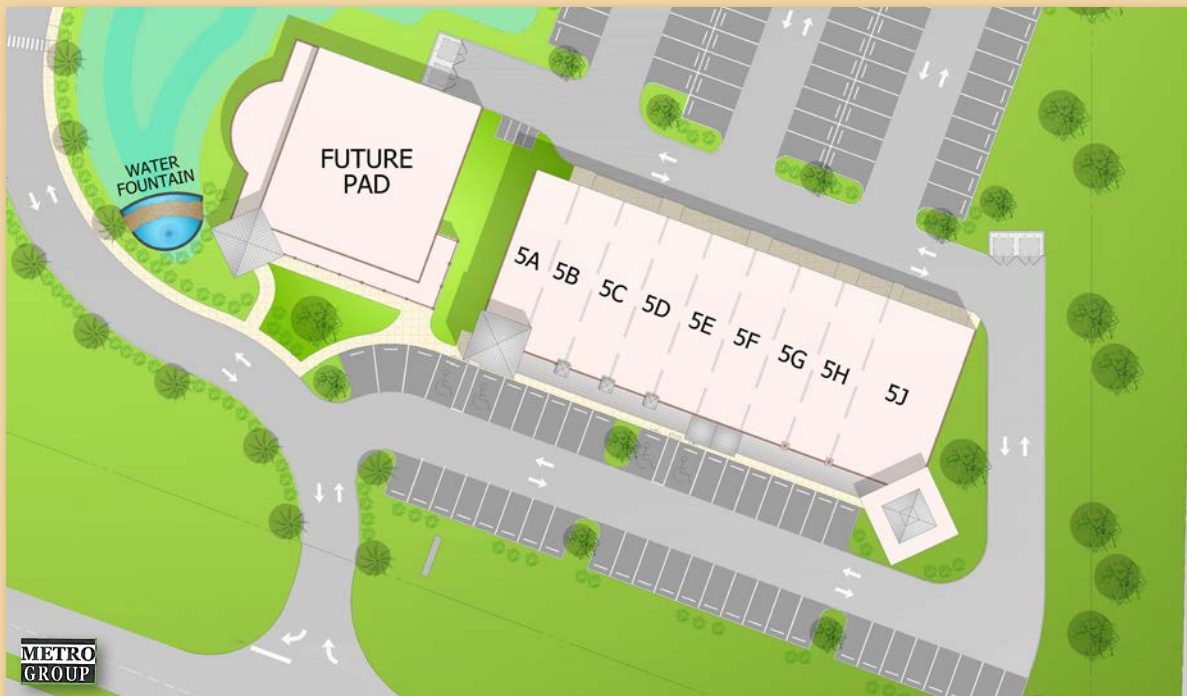
Enlarged Building Plan showing Building 5 Spaces 5A – 5H each 1,500 square feet Space 5J at 3,000 square feet Future Restaurant Pad 6,000 square feet plus 1,500 square feet Patio