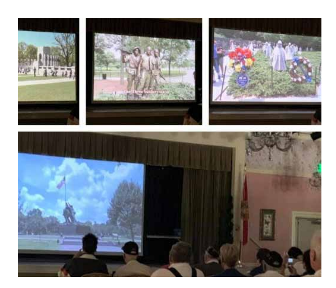
Thanks to video editing and technology, the 23 veterans taking part in Saturday's flightless Honor Flight experienced visits to several memorials in Washington, D.C.

After unloading at the recreation center, the veterans were greeted by numerous well-wishers and the TSA Honor Guard from Orlando International Airport.