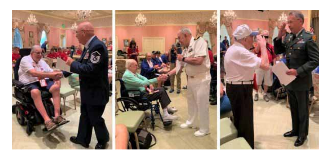
Each participating veteran in Saturday's flightless Honor Flight received a certificate of thanks from their attending presenter representing their branch of service.

After lunch, the veterans enjoyed some time to take photographs, then continued their day with a visit to the World War II Memorial, the Korean War Memorial, the Lincoln Memorial and the Vietnam Veterans Memorial.