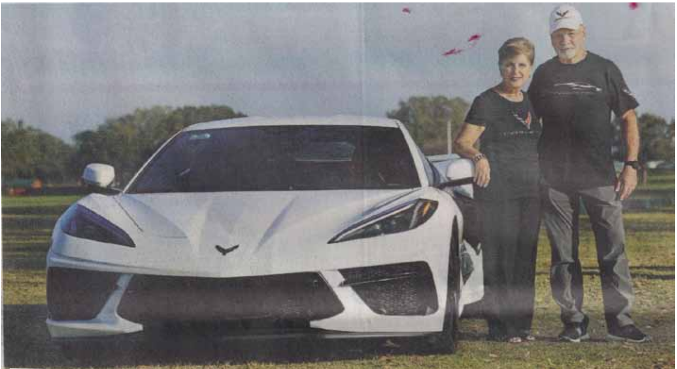
In 1970, these native New Yorkers bought one of America's greatest sports cars — a 1964 Stingray convertible. Through the years, they also owned keys for lots of other ignitions — from street cars, race cars and Mustangs to Ferraris.